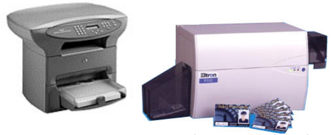
Our printer technology is leading edge.

GuestSafe has capabilities of capturing extra data for enhanced security. Extra channels of acquisition allow for vehicle data to be captured for security tracking.